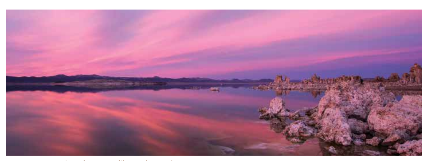
Mono Lake and tufa spring.

1) https://sierrawave.net/ ladwp-runoff-preparations-way-eastern-sierra/ 2) https://www.kpcc.org/2017-04-12/ ladwp-to-supplier-take-our-extra-water-no-charge 3) https://www.inyowater.org/wp-content/uploads/2024/02/2-8-24-SC-Meeting-Backup-Material.p df slide 9