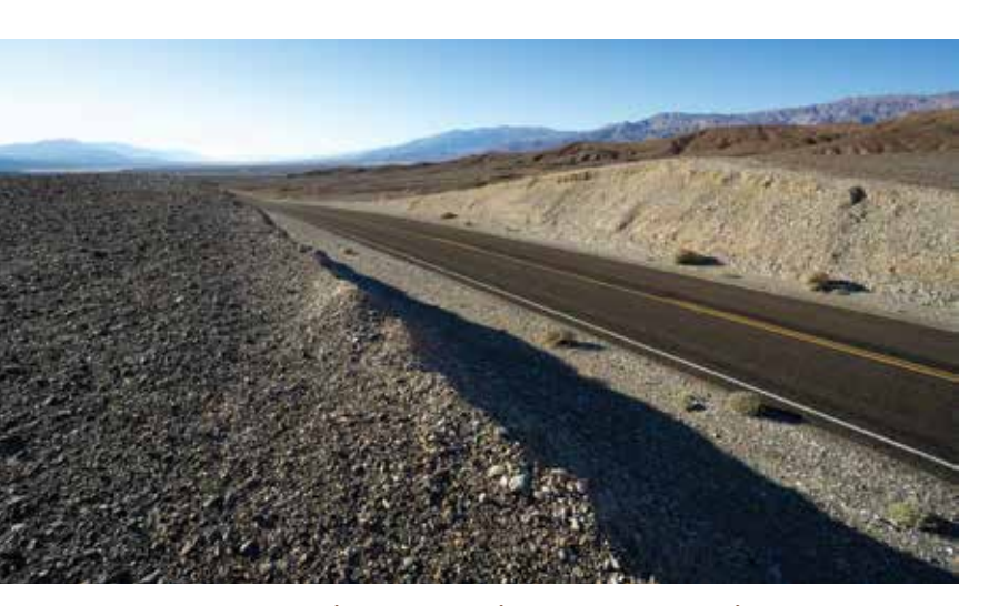
The highway cuts right through the spit. Death Valley, once filled to a spot above and behind the spit, is in the background.

Just four months ago in August, Hurricane Hilary dropped some 2.2 inches of rain on Death Valley – more than typically falls here over the course of a year. With virtually no soil to absorb it, the water ran off immediately. It gathered in rivulets, confluenced into small channels, then larger channels, and finally into streams that flash-flooded down canyons and alluvial fans. The flooding closed every road in the national park. It's now