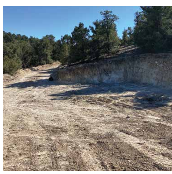
Dill pad with road leading to it. Lynn Boulton