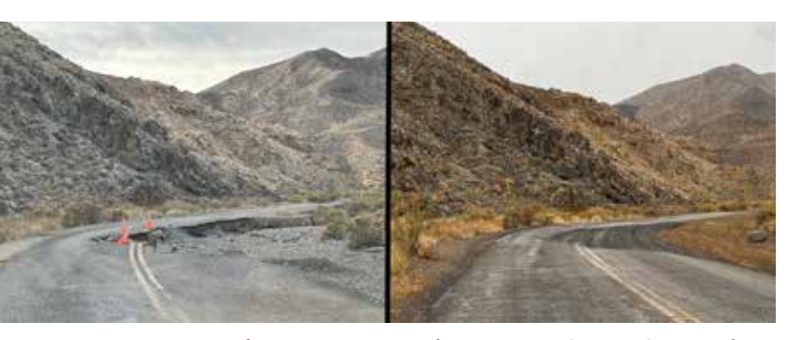
Emigrant Canyon at milepost 5.1 before & after repair.

The message which is emphasized again and again is that Native peoples deserve to be present and heard when decisions are made about lands which were once theirs and have been taken away by force. The video is important and deserves to be widely seen.