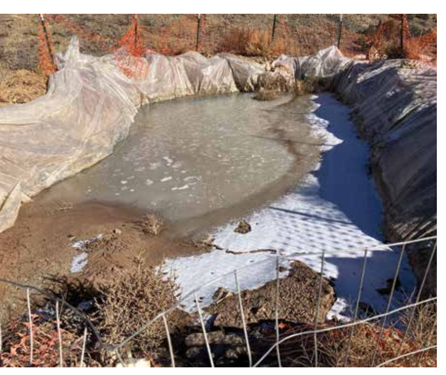
Sump pit at existing drill site. Lynn Boulton

The Polaris plan of operations estimates they will remove 4,000 trees. These will mostly be healthy, mature pinyon trees, but might also include Jeffrey pines, limber pines, or lodgepole pines that grow at the top of the Brawley Peaks.