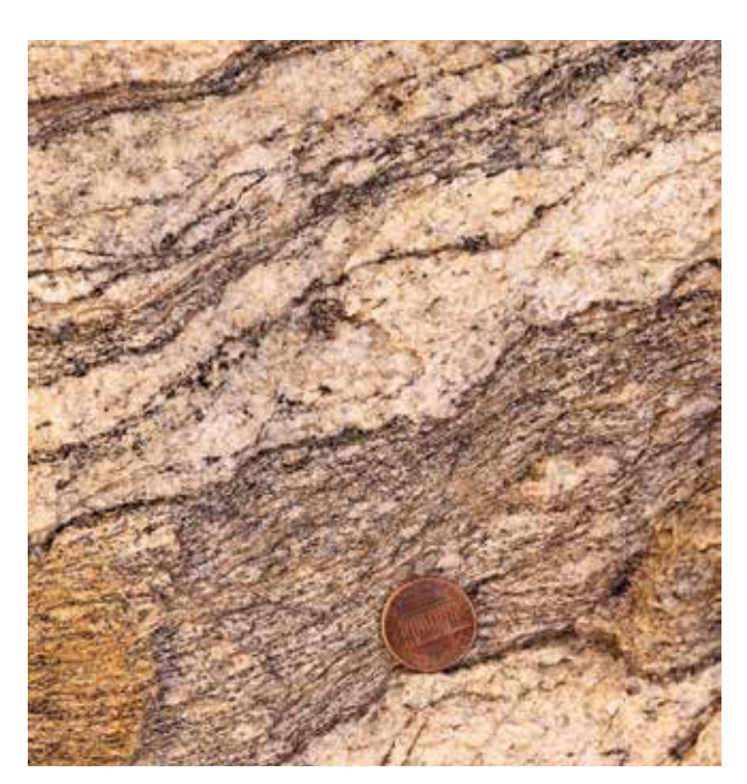
Migmatite gneiss, formed by partial melting of rock during high temperature metamorphism.

I've studied geology my entire adult life, and I still find it incredible that I can hold, in my own hands, a piece of the Cambrian sea floor. Each of the millions of tiny sand grains that make up this rock originated from some still-older rock and were transported by streams to the Cambrian shoreline. There, they were probably kicked around by coastal waves until getting buried by layers of more sediment, followed by more sediment for who knows how long – until circulating groundwater cement-