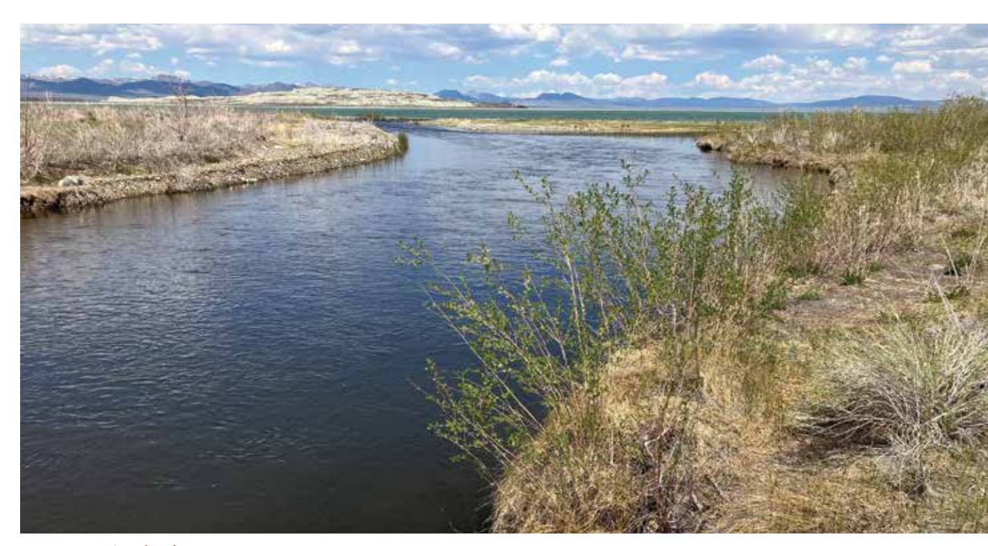
Rush Creek flowing into Mono Lake. Lynn Boulton

Based on the best hydrological data at the time, the lake was expected to rise to the mandated level within twenty years under the rules spelled out in the decision defining how much water the LADWP could take. There was to be a review of the rules in 2014 if the lake was not coming up as planned. LADWP asked the SWRCB that review be pushed to 2023, which was granted. Twenty-nine years of experience tell us that the lake is not going to reach a lake level of 6392 feet under the current rules. Now entering the 30th year, the lake level is nine feet short of the goal as of February 1, 2024, even though the lake rose almost five feet in the unprecedented runoff year of 2023. The stream diversions have to be temporarily reduced or suspended to allow more water to flow into the lake. → PAGE 5