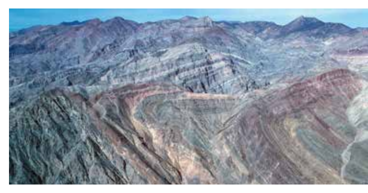
Overturned Anticline in Titus Canyon-the Zabriskie Quartzite forms the prominent red cliffs in the right-center of the photo. To the left (west) is overturned Cararra and Bonanza King Formations. At the canyon mouth, the rocks are nearly horizontal, yet upside down.

ed the compacted grains together as layers of rock. In the Death Valley region, there are more than 10,000 feet of sedimentary rock on top the Zabriskie Quartzite and at least another 10,000 feet of sedimentary rock below. Each bedding plane in that sequence of rock was once the Earth's surface.