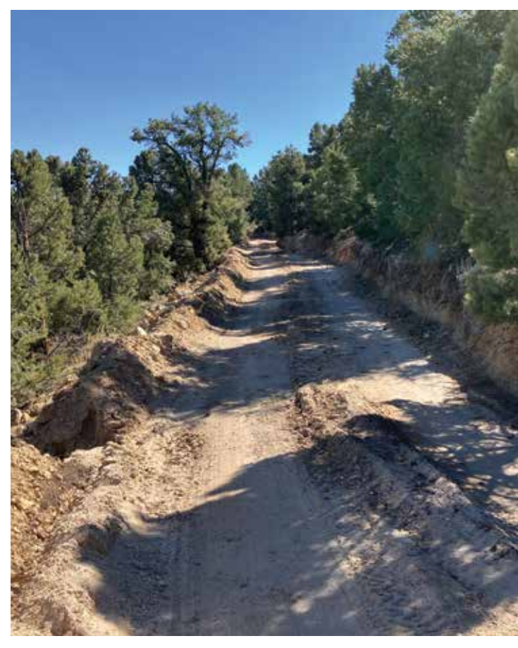
Temporary road in the Bodie Hills. Lynn Boulton

Mineral exploration companies drill several holes at each drill site in different directions hunting for the veins that have gold. They need to do this at hundreds of locations to create a map of the deposit underground. This means there will be future drilling projects in the area after this one. They need to round up investors in between projects. Each drilling project provides more information and brings them closer to turning the hidden resource into a gold reserve that can be mined. Because the gold is microscopic, gold mines are very large open pits. If the dirt contains low grade ore at 0.05 ounces of gold per ton, then twenty tons of rock need to be removed (two truck-loads), crushed and leached with a sodium cyanide solution to extract just one ounce of gold. It may be only two tons of dirt for higher grades of gold at 0.452 ounces per ton.